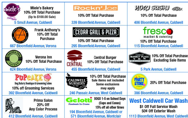
Back of Card